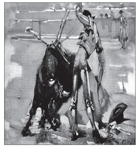
Matador vs bull

KEEP IN MIND: As we will see in the next chapters, the pawn exchange 5...dxe5 is a less attractive defensive option, but it usually serves to reduce White's initiative. After 6.fxe5 in this concrete case, the best method for Black would be 6...②fd7 7.②f3 c5!≠.