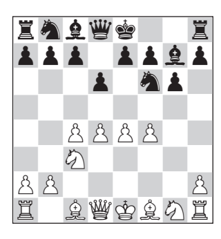
(Four Pawns Attack vs KID)